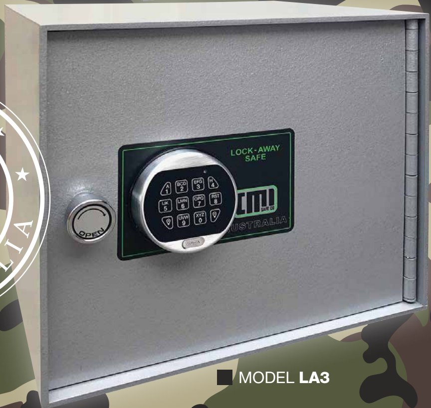
■ MODEL LA3