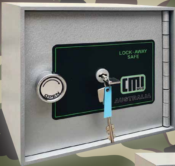
■ MODEL LA1