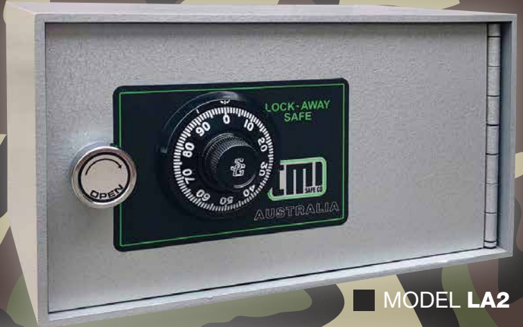
■ MODEL LA2