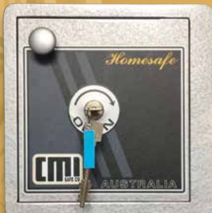
■ MODEL HS2