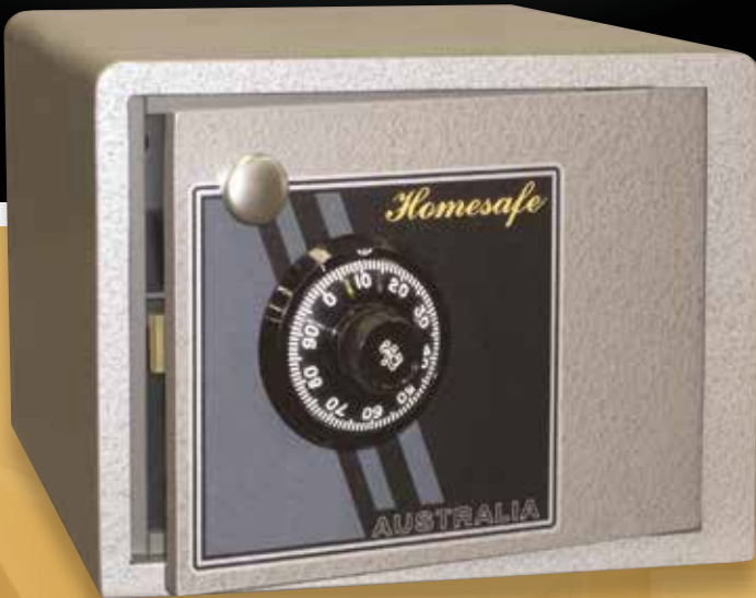
■ MODEL H2