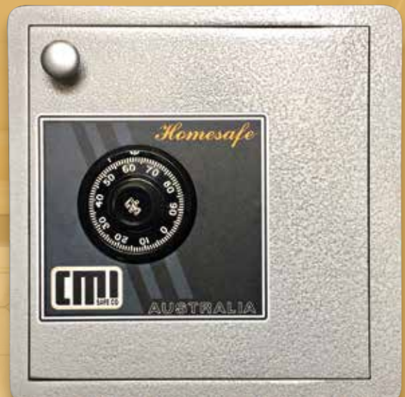
■ MODEL HS5