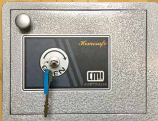
■ MODEL HS4