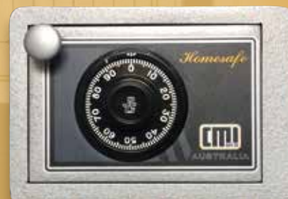
■ MODEL HS1